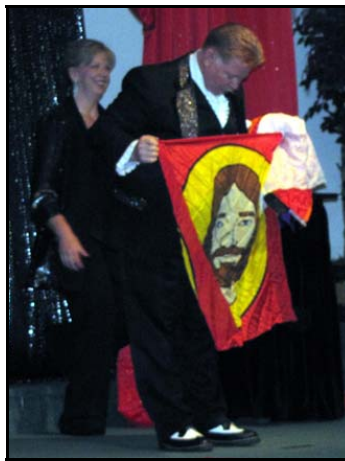
It is made clear at the beginning of our performance that Jesus is the focus of our ministry events.